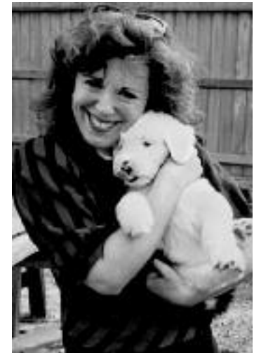
Snuggling with Toby at the breeder’s, the day I finally got to bring him home. (Just hours before I discovered all those spots!)