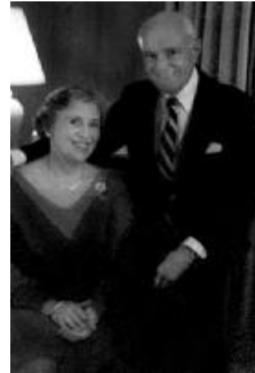
Mummy and Daddy, 1982'ish.

Ladies and gentlemen of the jury, you've heard solid evidence now that God speaks to me through my dreams.